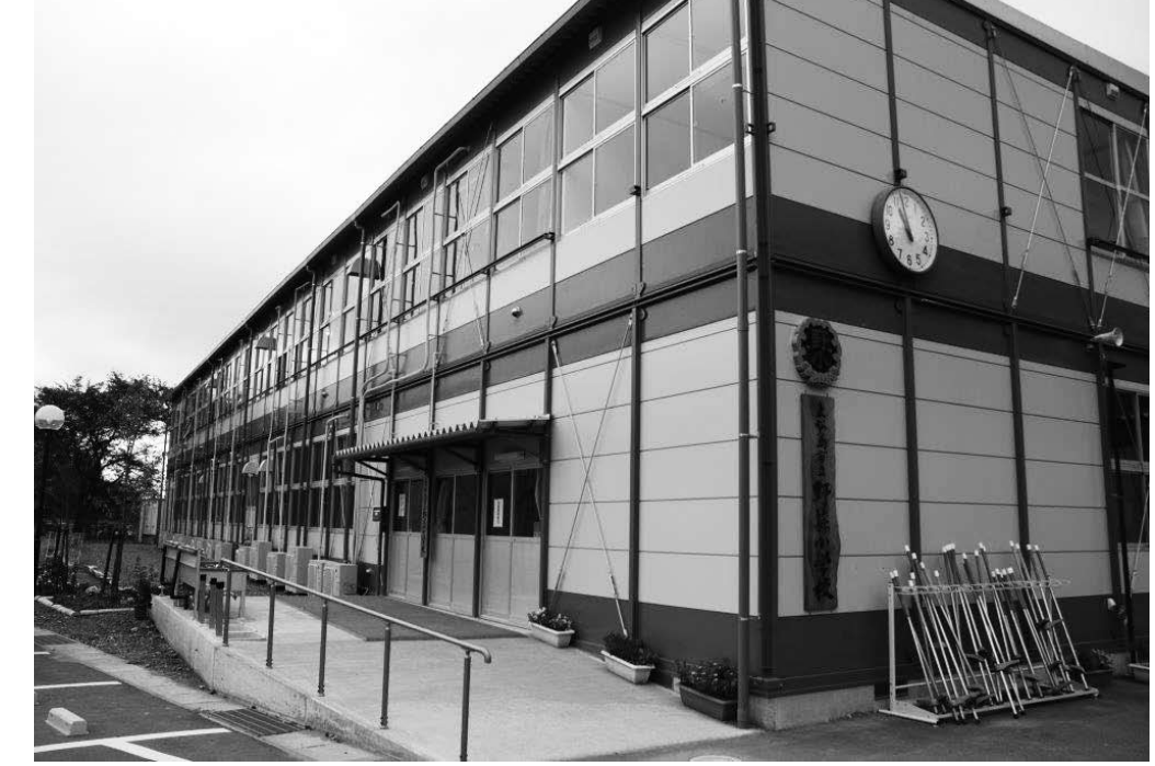
Nobiru Elementary School, Higashi Matsushima 2 and a half years have passed since the Great East Japan Earthquake. Most children still study at temporary prefabricated school buildings.

Nevertheless, the most important issue is to change Japan "Country with Non-nuclear Power." Zenkyo concentrates its energies on the campaign with citizens under a slogan of "No Necessity Nuclear Power Plants in Children's Future."