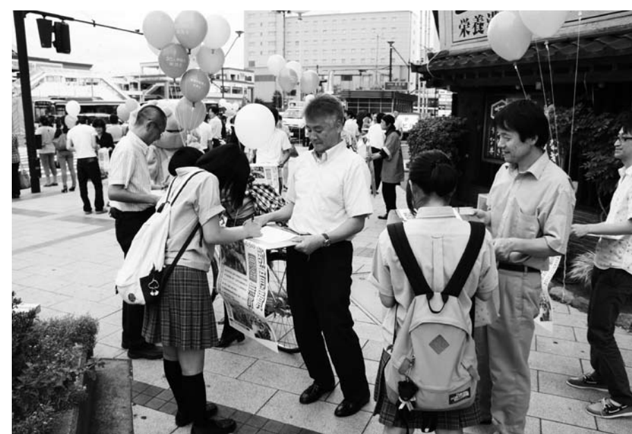
Zenkyo campaigns the "Nationwide Signature Campaign for Education" in Nagano prefecture.

mary schools in April 2011, however, the improvement of class-size condition has stopped since then. Zenkyo has been strongly requested to the state to increase education budget, while Japanese education budget is the lowest level in the world, to at least on the same level of OECD, and to continue improvement of educational conditions.